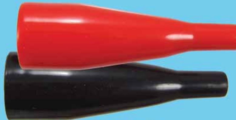
Insulator for 501997 Series