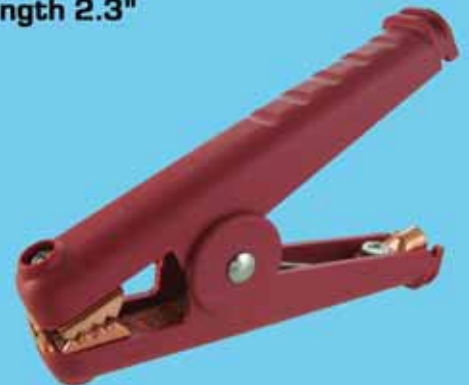
Fully Insulated Heavy Duty Clamp with Serrated Copper Teeth, 500 Amp