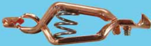
General Purpose Test Clip, Solid Copper, 40 Amp