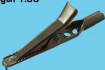
Alligator Clip, Steel, Fang Tooth with Barrel