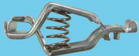
Small Heavy-Duty Clip, Steel, 25 Amp