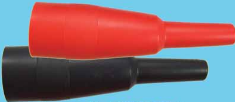
Insulator for 501996 Series