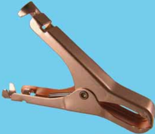
Small Charger Clip, Solid Copper, 75 Amp