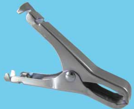
Small Charger Clip, Steel, Zinc Plated, 50 Amp