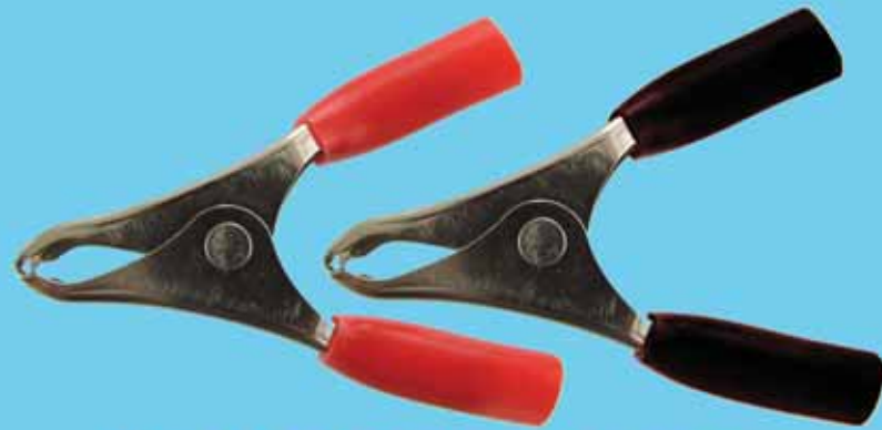
Petite Plier-Type Clip, Steel, 15 Amp