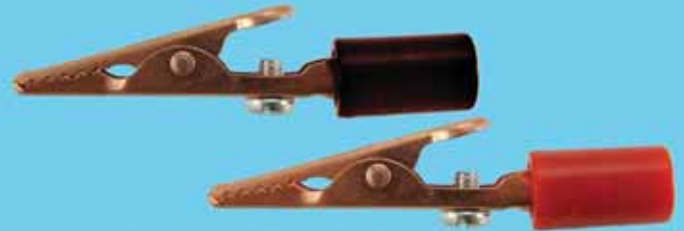
Alligator Clip, Solid Copper, with Barrel, Screw & Handle, 10 Amp