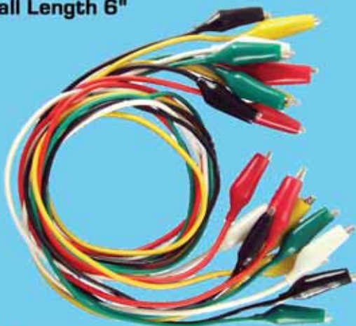
Multi-Color Insulated Lead Set