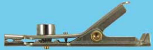
Telecom Clip, Bed of Nails and Single Spike Combo -Glove Style