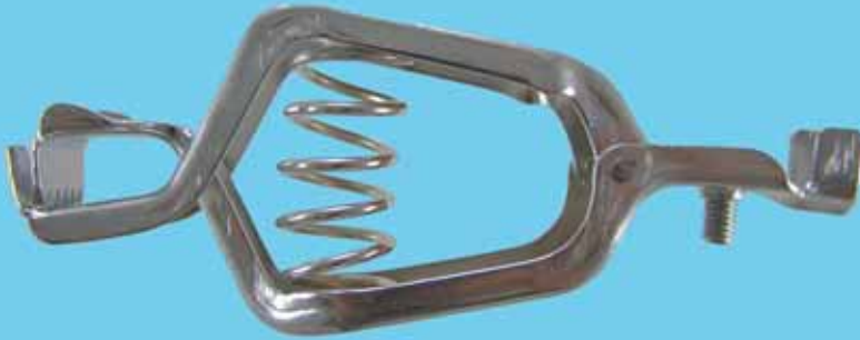
Clip, Steel, 50 Amp