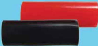
Insulator for the 501774 Series, {2 Req'd per clip}