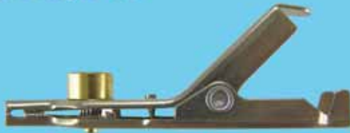
Telecom Clip, Bed of Nails and Single Spike Combo -Mitten Style