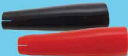
Insulator for 502005 Series