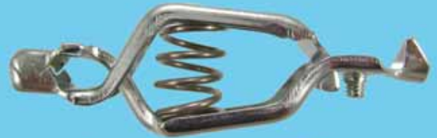
Auto Clip, Steel, 40 Amp