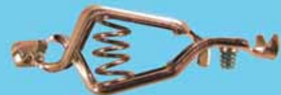
Analyzer Clip, Solid Copper, 20 Amp