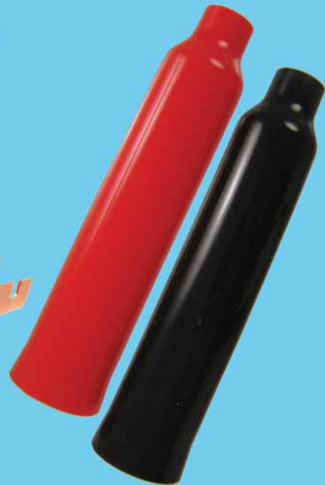
Insulator for the 501849 Series, {2 Req'd per clip}