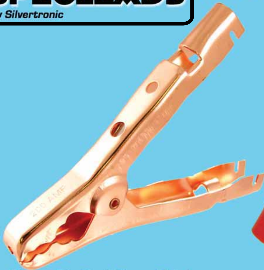
Large Charger Clip, Steel, Copper Plated, 200 Amp