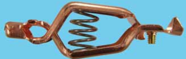
Auto Clip, Solid Copper, 75 Amp