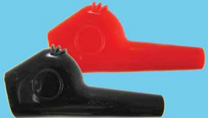
Insulator, Mitten Style for the 501791 Series