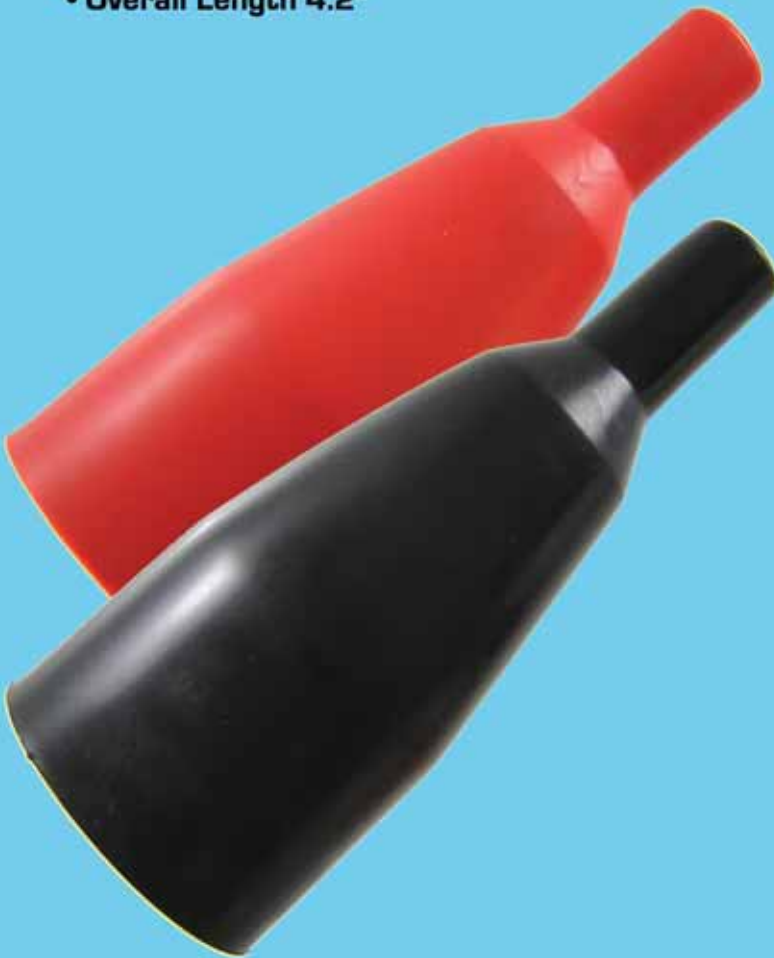
Insulator for 501790 Series