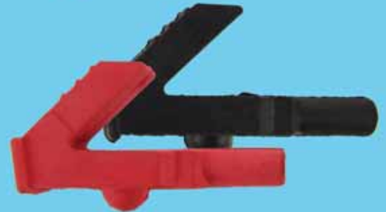
Insulator, Glove Style for the 501792 Series