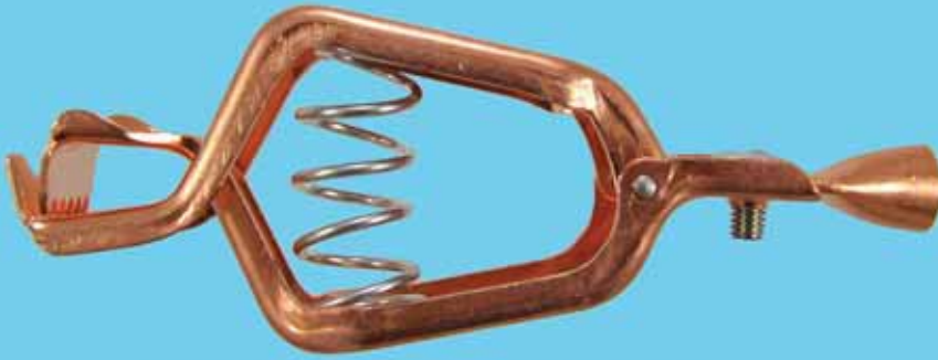
Clip, Solid Copper, 100 Amp