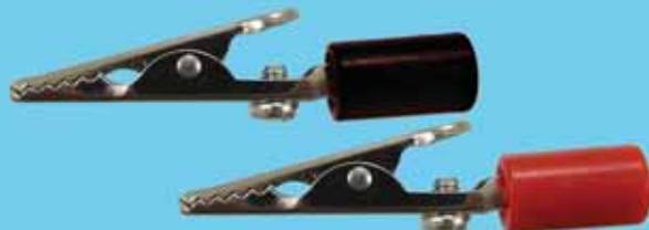
Alligator Clip, Steel, with Barrel, Screw & Handle, 10 Amp