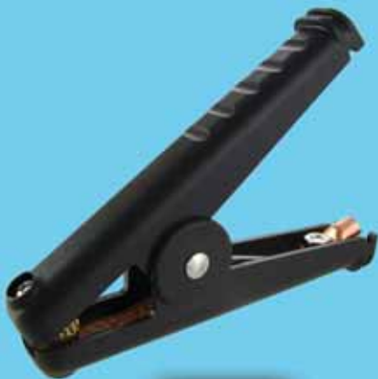
Fully Insulated Heavy Duty Clamp with Solid Copper Pads, 500 Amp