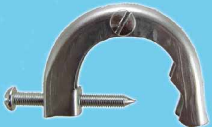
Grounding Clamp, Steel, 50 Amp